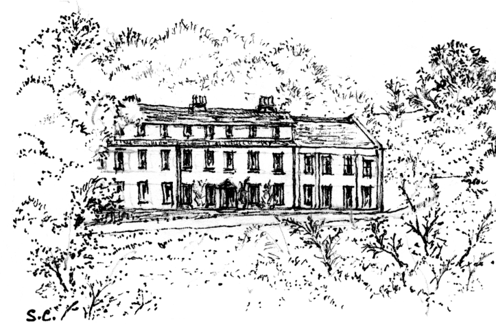
Waddow Hall from across the Ribble